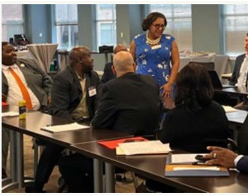
White House HBCU Week Washington, DC September 19, 2022