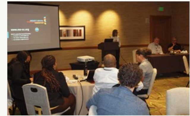
Technology Exchange Denver, CO December 6, 2022