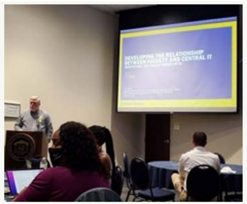
North Carolina A&T State University Greensboro, NC June 23, 2022