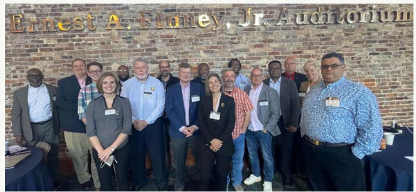
Claflin University Orangeburg, SC March 21, 2023