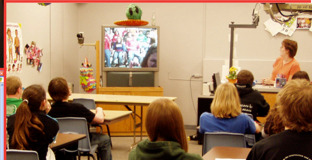
◀ The United States Holocaust Memorial Museum is developing a distance learning course on how to teach about the Holocaust, using Internet2 to enable multipoint videoconferencing capabilities.