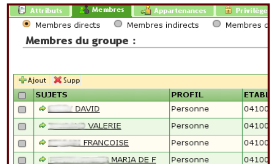
Defining Group Members

The schools and other stakeholders have been pleased with the rollout of the educational portals. As envisioned, some teachers have become “advanced users,” and have taken on the administrative role of provisioning access to others within their schools. Handling of dynamic groups is one of the goals for an upcoming version.