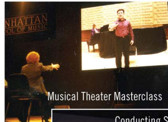
Musical Theater Masterclass